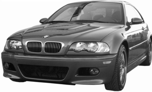
Siraj Podikunju's 2002 M3 with SMG

A new feature to your NewsWerks If you have a new or used BMW that has been recently added to your family, why not share it with ours. We would love to see it !