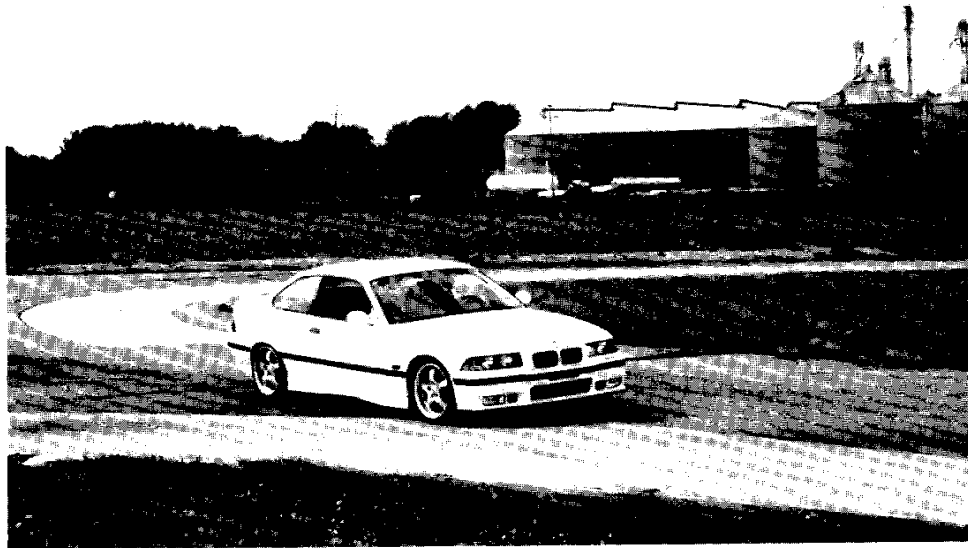
Fun at Marshalltown, Who needs golf ?