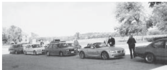
The Cars, the Beautiful Cars