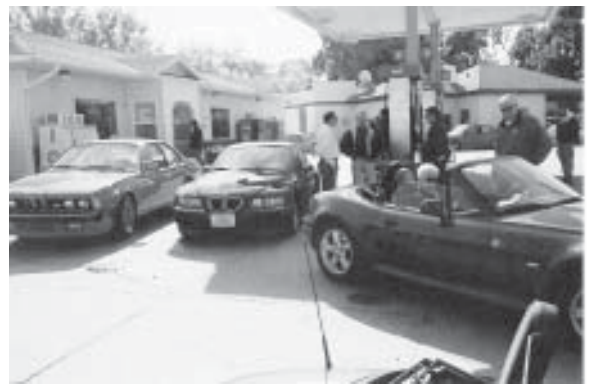
The Pit Stop