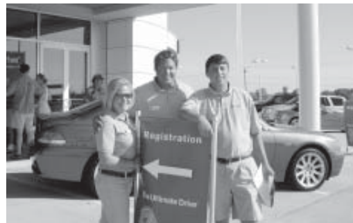
The Komen Crew from BMW NA