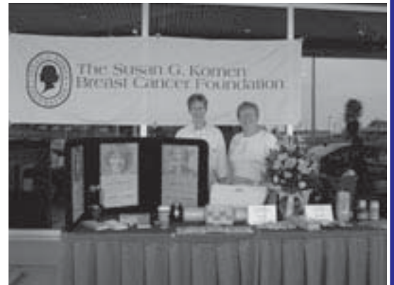
The local Komen Volunteers